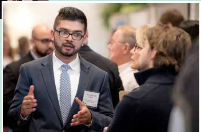
The 9th Annual Osteopathic Poster Competition and Exhibition, held April 27 in conjunction with the Symposium, drew 147 abstracts in three categories (biomedical, case reports, exhibition) and awarded $5,750 in prizes.