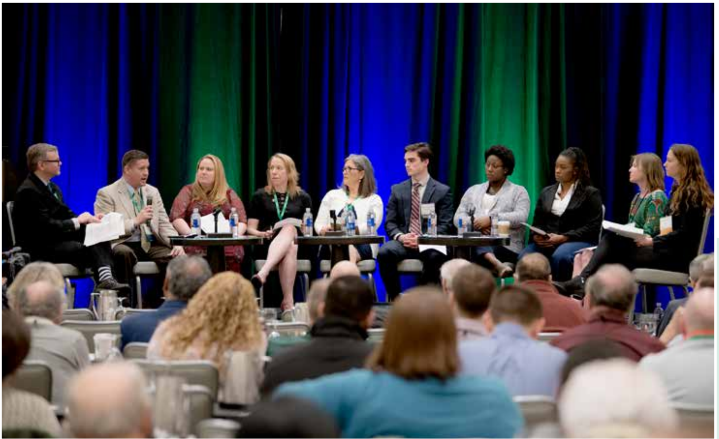
A panel of speakers participated in a "community conversation" about opioid use in Ohio. The session launched a series of conversations across the state.