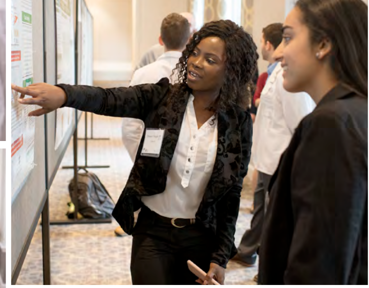
The Eighth Annual Regional Osteopathic Poster Exhibition & Competition was held, Saturday morning April 28, during the Symposium.