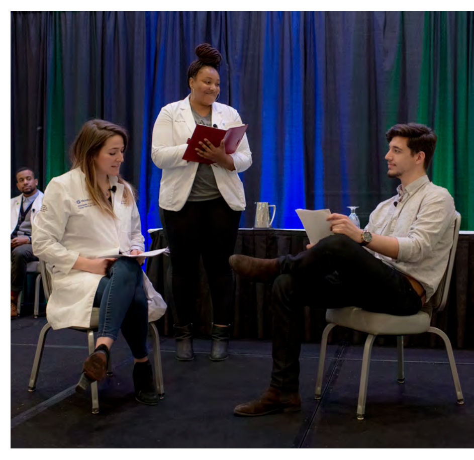
Role-playing during the Symposium session addressing racism in clinical settings.

Takeda Pharmaceuticals Visiting Physicians Association